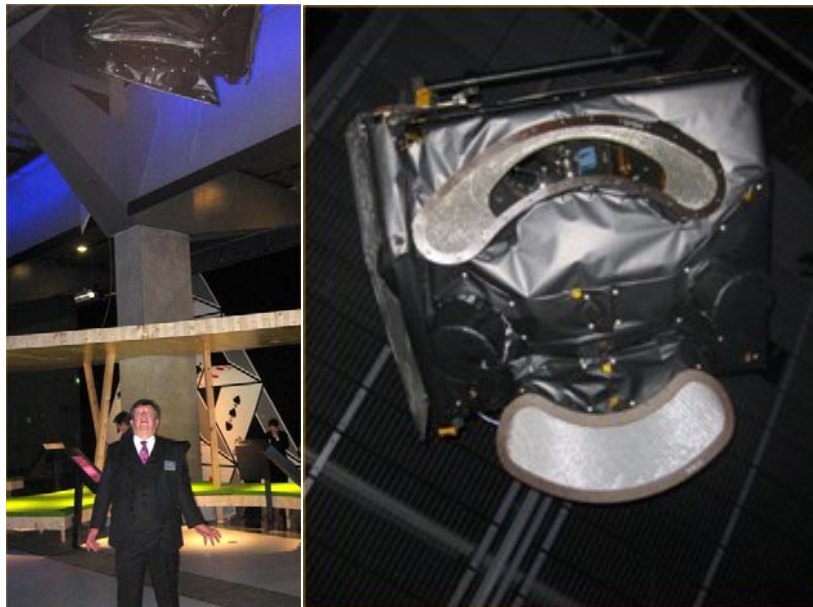
Figure 1: In London’s Science Museum, the AATSR Structural/Engineering Model is on display as part of their new exhibition “Atmosphere – Exploring Climate Science”. The panel on the left includes an example of an anthropogenic species for scaling purposes.

In this synopsis, some of the most important of the many lessons learned from the mission are briefly described.